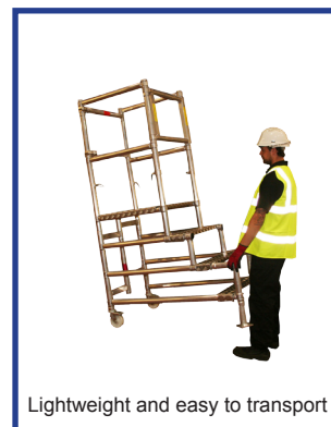
Lightweight and easy to transport