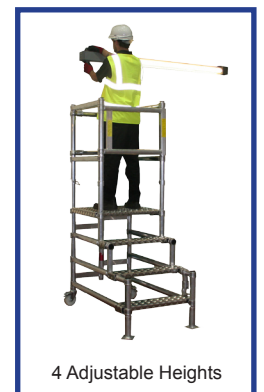
4 Adjustable Heights

Designed and manufactured in the U.K through quality systems accredited to ISO9001:2000 and BS EN 1004:2004.