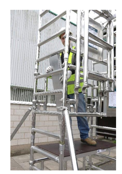
26. Temporarily locate the toeboard assembly on the platform to allow access to the additional platform that is stowed.