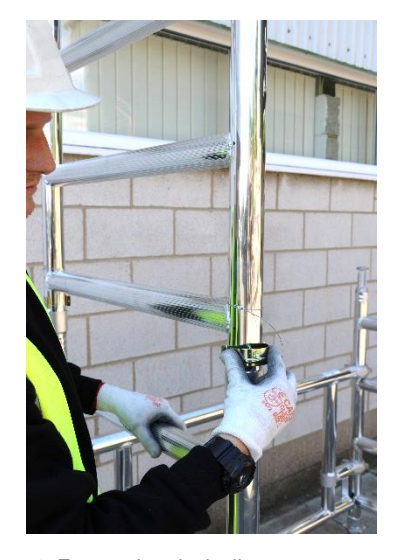
4. Engage interlock clips.