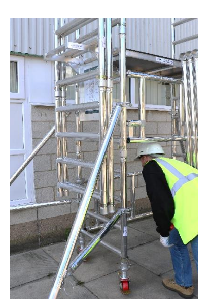
20. Access the platform by passing under the side frame and via the trapdoor platform.