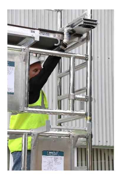
29. Relocate the toeboard assembly from the lower platform to the higher level, ensuring that it is positioned on the plain section of the platform as shown.