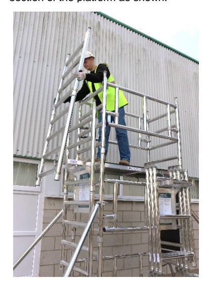
17. Retrieve a set of frames from the side assembly bracket and fit.