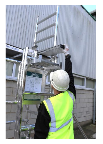
12. Relocate the toeboard assembly from the lower platform to the higher level, ensuring that it is positioned on the plain section of the platform as shown.