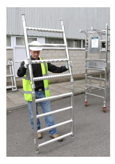
12. Assemble the frames in pairs as shown.