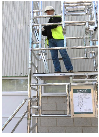
25. Temporarily locate the toeboard assembly on the platform to allow access to the additional platform that is stowed.