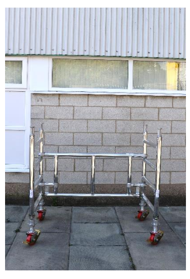
2. Fit a guardrail frame to the vertical member above the 3<sup>rd</sup> rung with the hooks facing outwards.