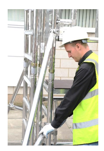
19. Fit 4 stabilizers, one on each upright of the tower.