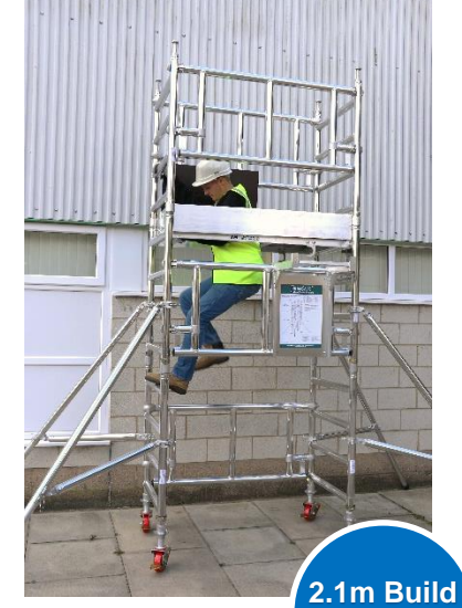
15. Access the platform using the trapdoor as shown and begin work.