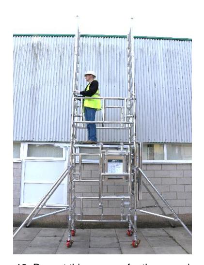
18. Repeat this process for the opposing side, ensuring that all interlock clips are engaged.