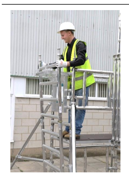
21. Retrieve a set of frames from the side assembly bracket and fit.