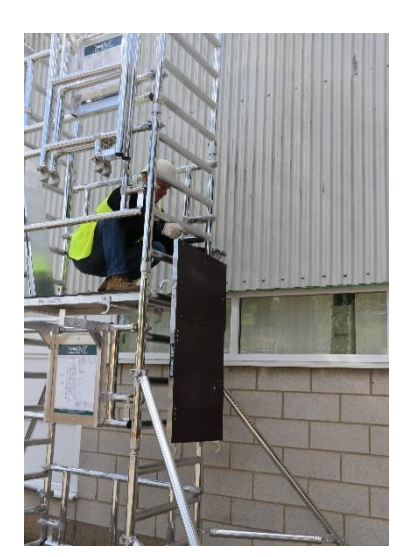
26. Remove the remaining platform from the lower section of the tower and pass up through the side frame.