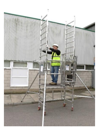
22. Repeat this process for the opposing side, ensuring that all interlock clips are engaged.