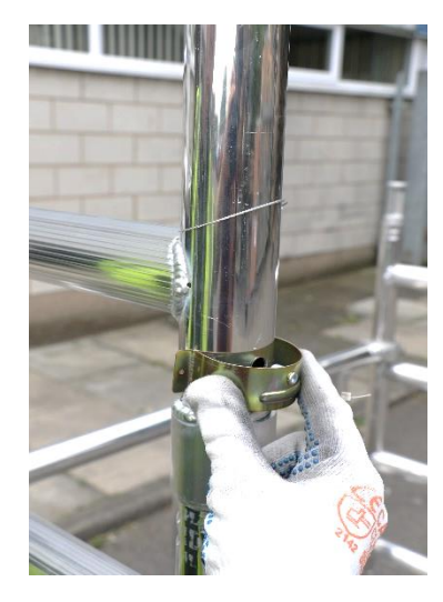
4. Ensure all interlock clips are engaged.