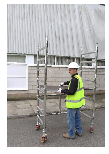
5. Fit platform on the 4<sup>th</sup> rung as shown.