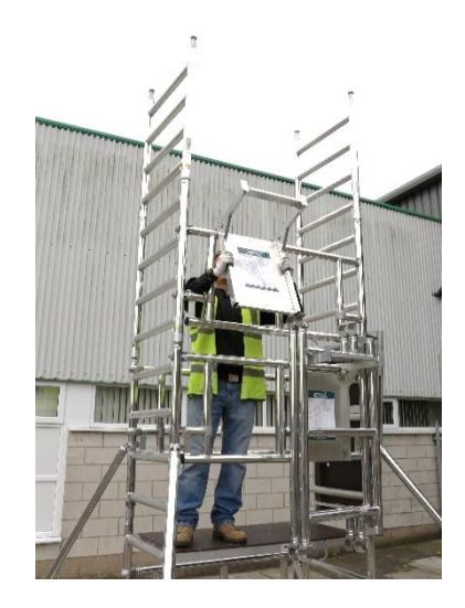
24. Relocate the side "empty" assembly bracket on the front of the tower (top rung of the tallest guardrail frame as shown)