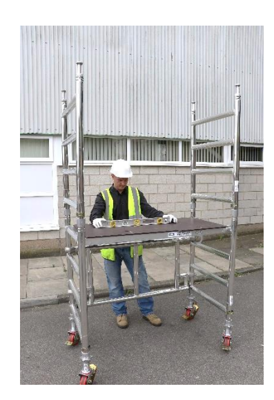
6. Ensure that the tower base is level at this point.