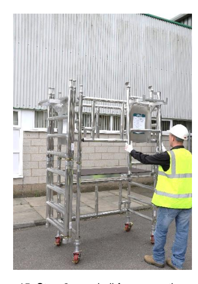
15. Stow 3 guardrail frames on the front assembly bracket.