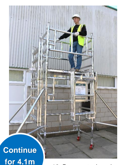
16. Remove toeboard.