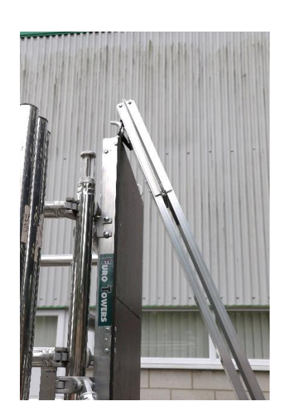
17. The toeboard can be located over the platform hook using the dedicated hanging strap.