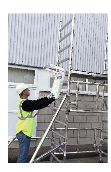
8. Fit an assembly bracket on the side of the tower.