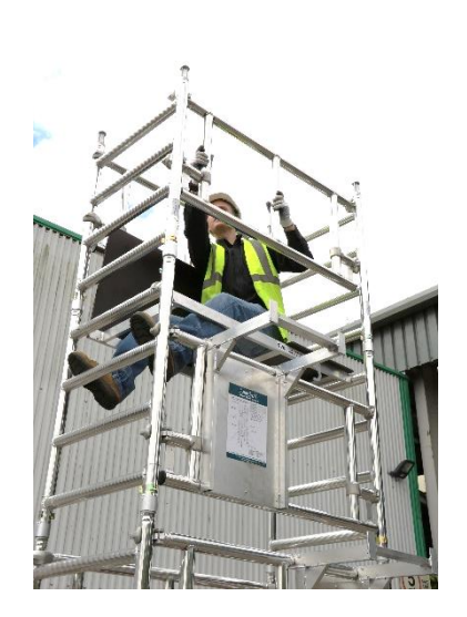
28. Fit 2 guardrail frames, with the top hook (facing outwards) set above the top rung of the frame.