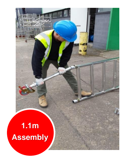
1.Insert legs and castors into a pair of frames.