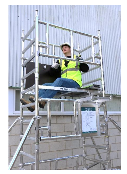
13. Fit 2 guardrail frames, with the top hook (facing outwards) set above the top rung of the frame.