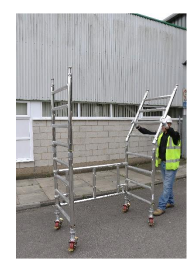
3. Fit 1 set of frames to each end of the tower.