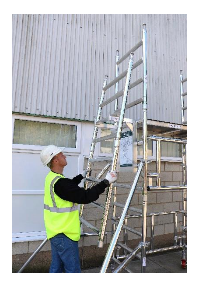
10. Stow the frames on the side assembly bracket