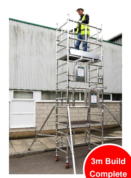
30. Access the platform using the trapdoor and unfold the toeboard.