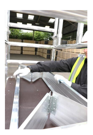
9. Fit toeboard by unfolding the set above the platform (please use labelling as a reference to ensure that the toeboard is the correct way up.