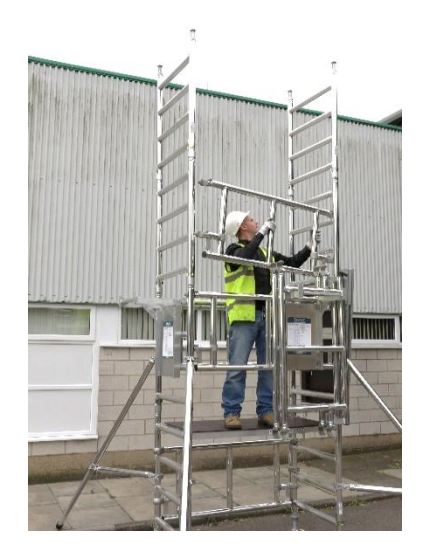
23. Retrieve a side guardrail frame from the front assembly bracket and locate it as shown.