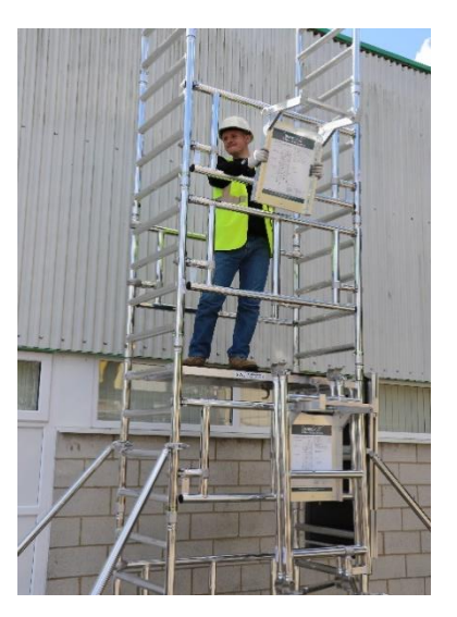
22. Place the removed bracket on the top rung of the tallest guardrail frame as shown.