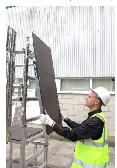
16. The platform can be located on the opposing side of the tower from the frames.