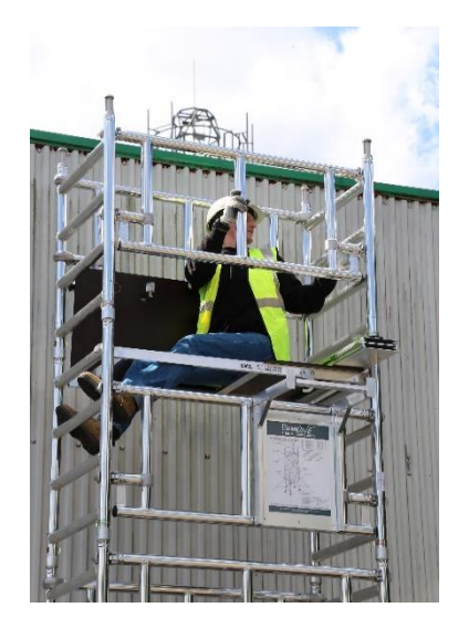
29. Fit 2 guardrail frames, with the top hook (facing outwards) set above the top rung of the frame.