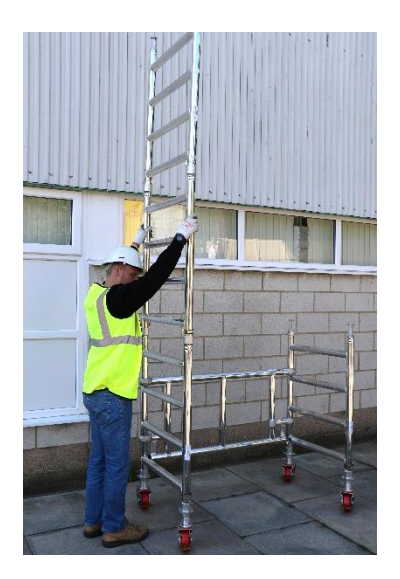
3. Connect 2 frames together and fit onto the base section at each end.