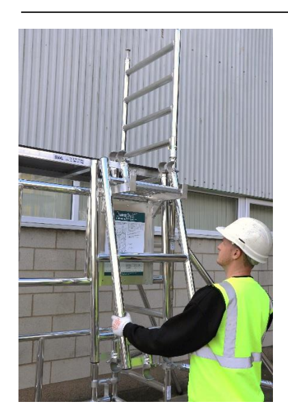
11. Stow the guardrail frames on the front assembly bracket.