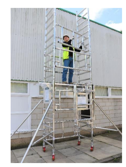
20. Fit 1 side guardrail the 3<sup>rd</sup> rung above the existing as shown.