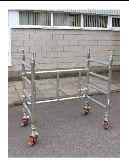
2. Fit a guardrail frame to the vertical member above the 3<sup>rd</sup> rung with the hooks facing outwards.