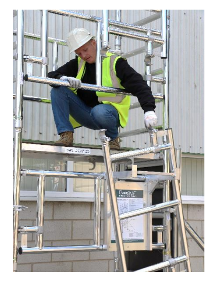
23. Retrieve 2 stowed side guardrail frames from the lower assembly bracket (front) pass them up to be relocated on the higher assembly bracket.