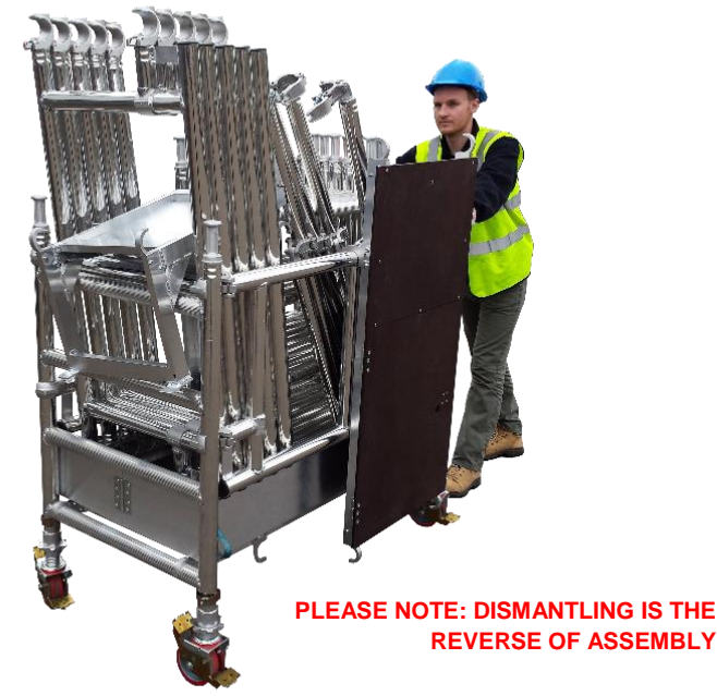
The Euro 1 Tower can also be used as a trolley for transport purposes.

The bases shown are prior to stabilizers being added.