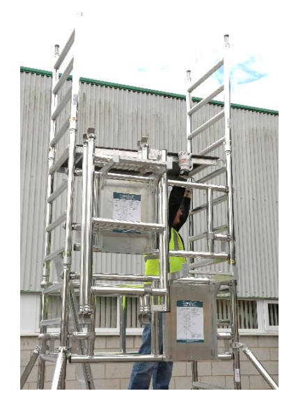
27. Fit the platform, 1 rung above the side frame location as shown.