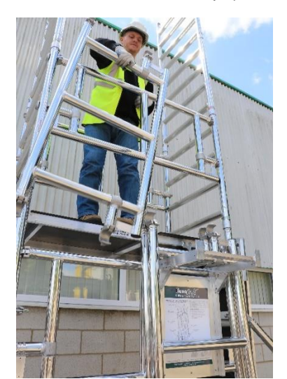
19. Retrieve a side guardrail frame from the front assembly bracket and pass upwards as shown.