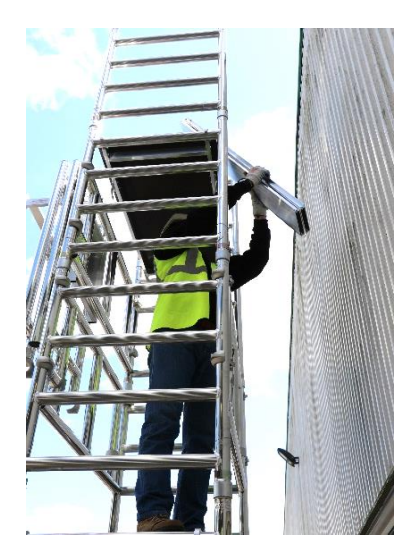
28. Relocate the toeboard assembly from the lower platform to the higher level, ensuring that it is positioned on the plain section of the platform as shown.