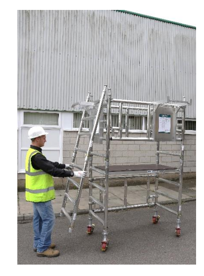
14. Stow 4 frames (2 pairs) on the side assembly bracket.