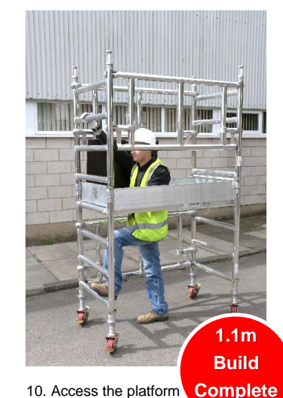
10. Access the platform using the trapdoor as shown and begin work.