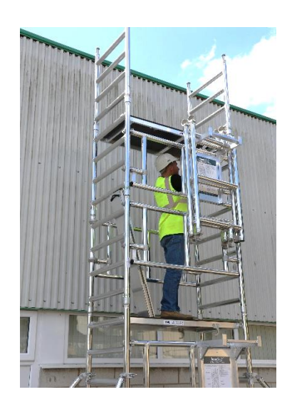
27. Fit the platform, 1 rung above the side frame location as shown.