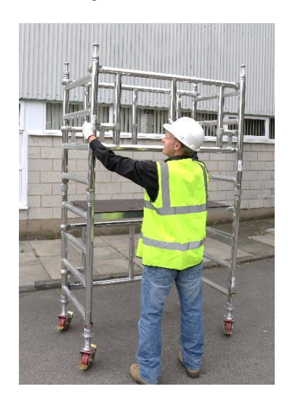
7. Fit a guardrail frame to each side of the platform (hooks facing outwards) Top hook above the top rung of the end frames. (Refer to labelling to ensure that the frame is the correct way up)