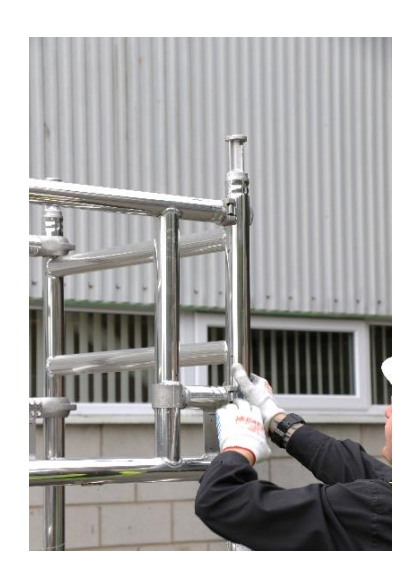
8. Ensure that all frames are securely fitted and that they are located the correct way up (use labelling as a reference)