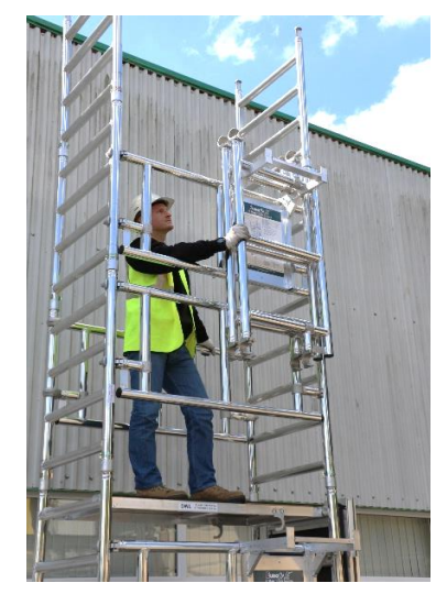
24. The frames are relocated as shown.