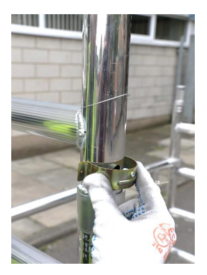
13. Engage interlock clips.