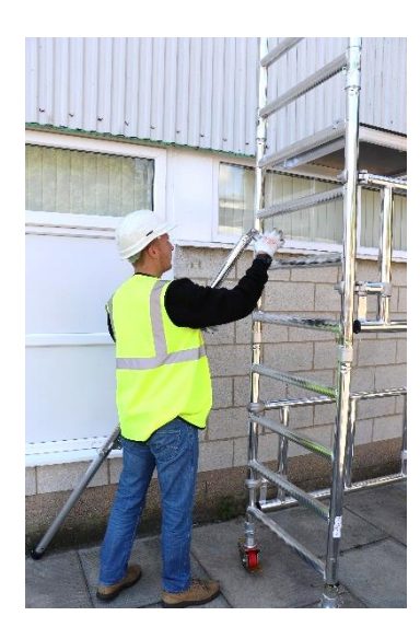
7. Fit 4 stabilizers, one on each upright of the tower.