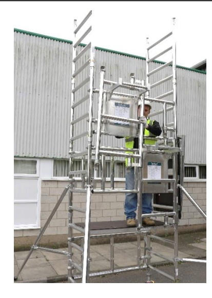
25. Retrieve a side guardrail frame from the front assembly bracket and locate it as shown.