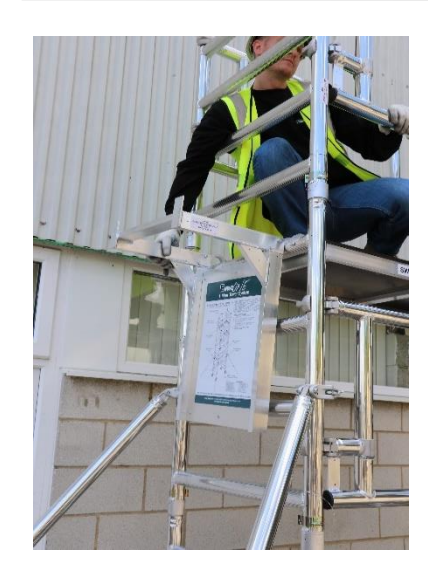
21. Relocate the "empty" assembly bracket from the side of the tower.