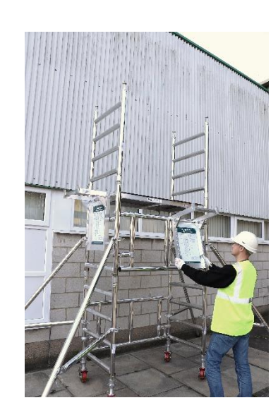
9. Fit the additional assembly bracket on the front of the tower as shown.