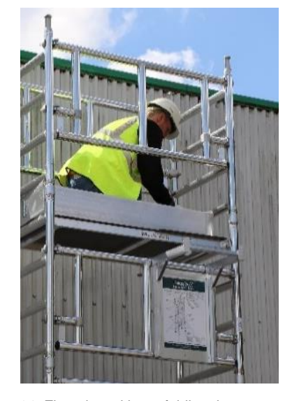
14. Fit toeboard by unfolding the set above the platform (please use labelling as a reference to ensure that the toeboard is the correct way up.