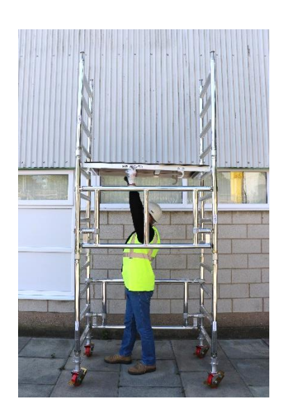
6. Fit the platform, 1 rung above the side frame location as shown.